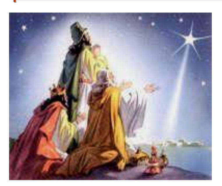
THE THREE WISEMEN